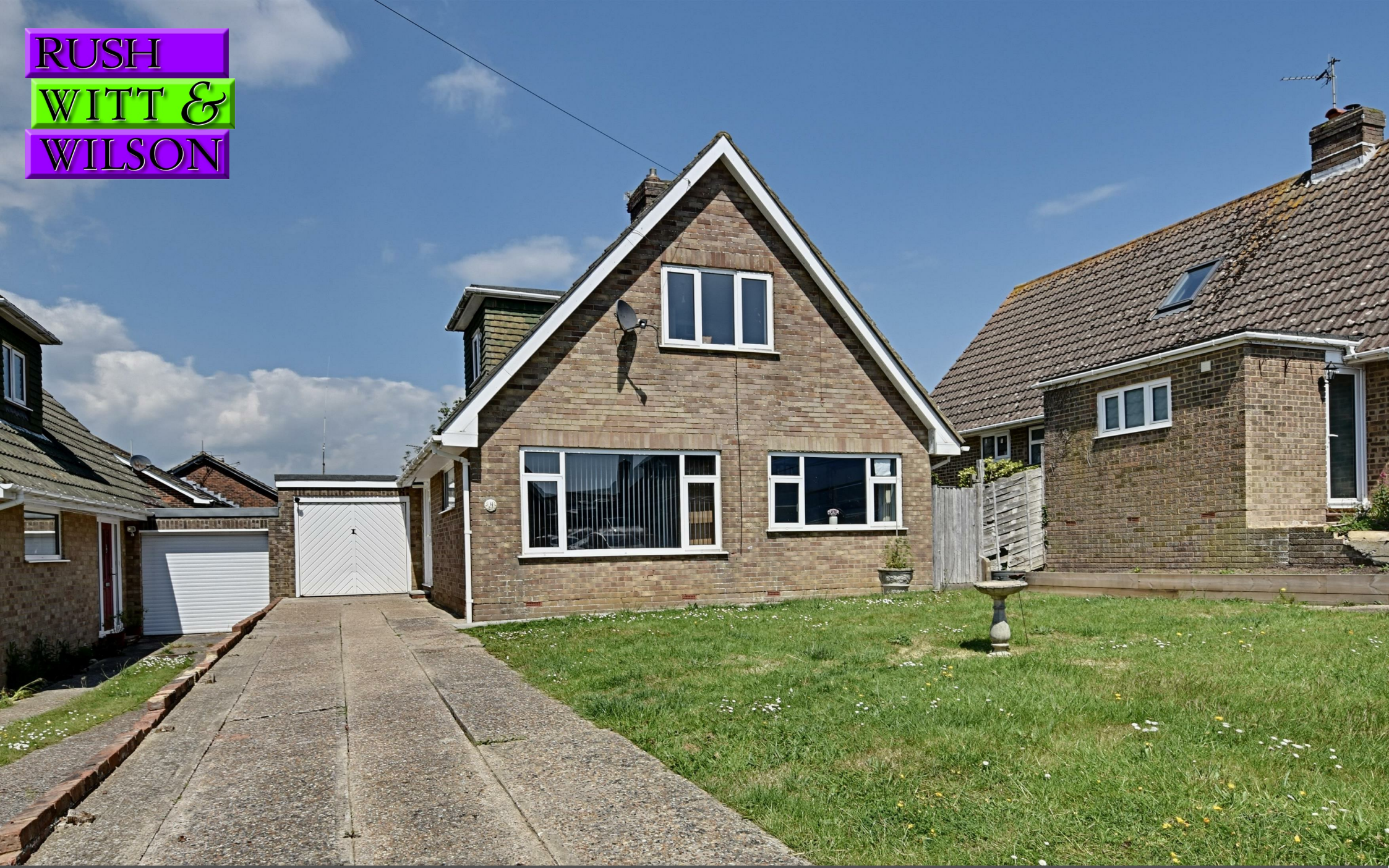
31 Martyns Way, Bexhill-On-Sea, East Sussex TN40 2SE £399,950