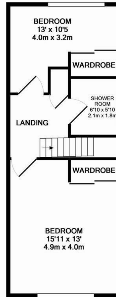
1ST FLOOR APPROX. FLOOR AREA 441 SQ.FT. (40.9 SQ.M.)

TOTAL APPROX. FLOOR AREA 1290 SQ.FT. (119.9 SQ.M.)